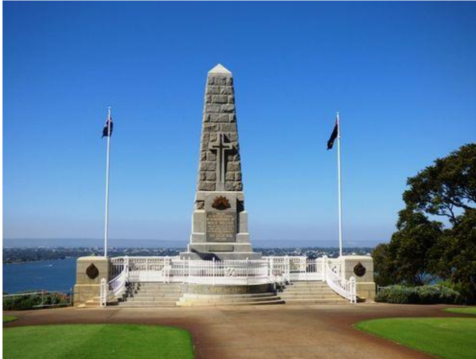
Western Australia State War Memorial Cenotaph, Kings Park (above) & (below) The Crypt with the Roll of Honour names

The heavy concrete foundations are supplemented by heavy brick walls which enclose an inner chamber or crypt. The walls surrounding the crypt are covered with The Roll of Honour; marble tablets which list under their units the names of more than 7,000 members of the services killed in action or as a result of World War One.