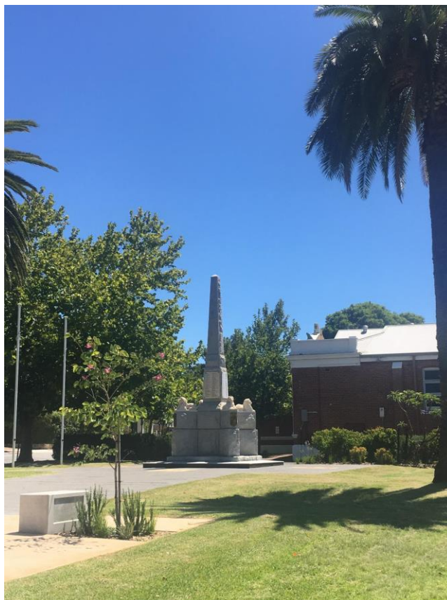
West Leederville War Memorial