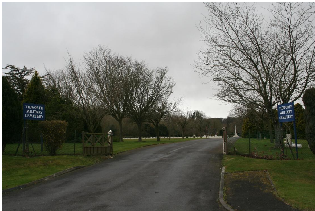
Tidworth Military Cemetery